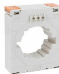
Current transformers DM35T0400