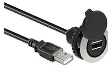
USB interface, A/A female type connection with 0.5m long cable LPFD0