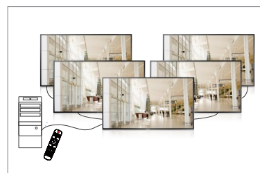
RS-232/ RJ45/IR for remote control