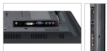
Versatile connectivity: VGA, DVI, HDMI, Composite, Component