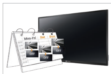
Built-in scheduler automatically activates and deactivates the PM-32 with designated input signal according to programmed schedules