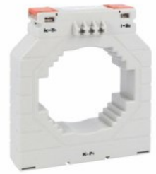
Current trasformers DM4T3500 Solid-core