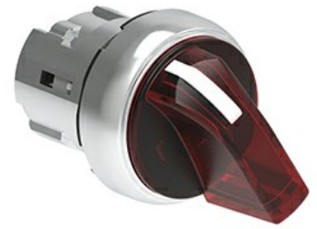
Illuminated selector switch actuator - 2 position LPSSL12