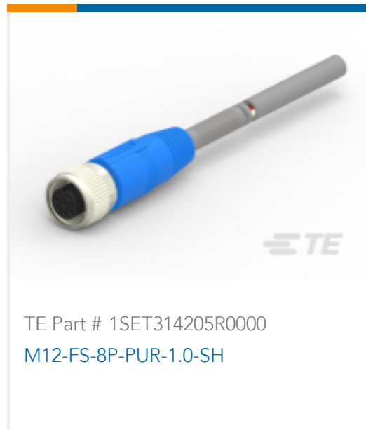
TE Part # 1SET314205R0000 M12-FS-8P-PUR-1.0-SH