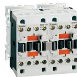
Reversing contactor BFA012