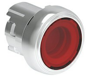
Illuminated button actuators, spring return - Flush LPSBL10