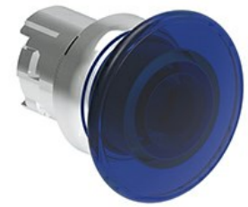
Illuminated mushroom head button actuators - Spring return Ø 40mm/1.6" LPSBL61