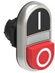
Double-touch actuators, spring return white indicator - One extended and one flush pushbuttons LPCBL72