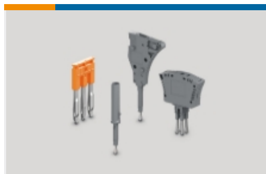
Terminal Block & Strip Conducting Accessories(67)