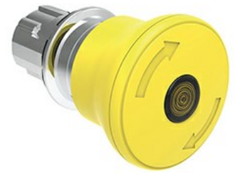
Illuminated mushroom head button actuators - Latch, turn to release Ø 40mm/1.6" LPSBL66