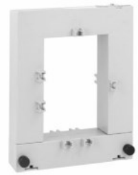
Current transformers DM3TA2000