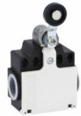
Roller lever plunger KCE