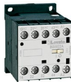
Auxiliary contactor BG00