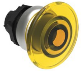
Illuminated mushroom head button actuators - Spring return Ø 40mm/1.6" LPCBL61