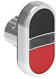
Double-touch actuators, spring return white indicator - Two flush pushbuttons LPSBL71