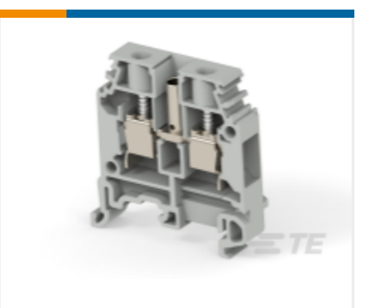
TE Part #1SNA115219R2600 M6/8.4