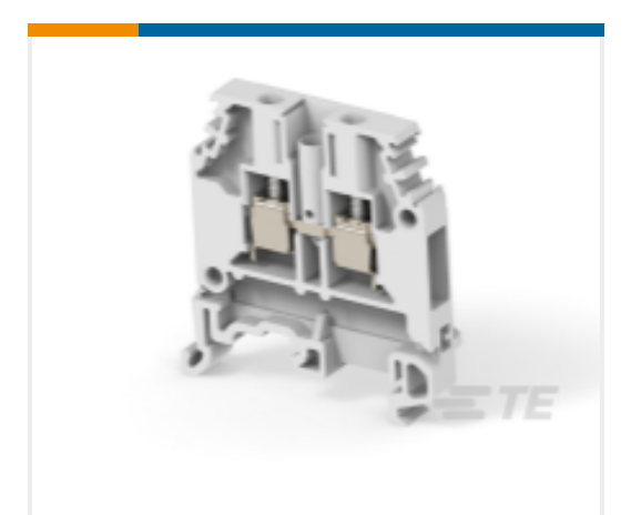
TE Part #1SNA115192R0400 M4/6.4