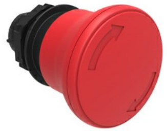
Mushroom head pushbutton, Latch, turn to release Ø 40mm/1.6" LPCB634