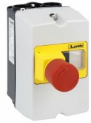
Surface mount enclosures IP65 (4X) for SM1P SM1Z Surface mount enclosures IP65 (4X) for SM1P SM1P...