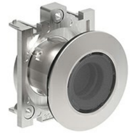
Illuminated button actuators, spring return - Flush LPFBL10