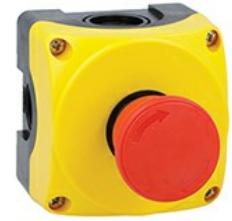
Yellow control station LPZP1A5 complete with mushroom pushbutton turn-to-release LPCB6344 1NC LPZP1B5602