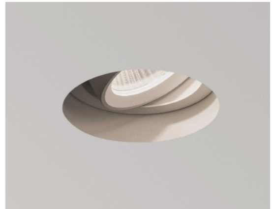
CODE: 1248010 FINISH: TEXTURED WHITE

TO MAINTAIN THIS PRODUCT TO ITS BEST CONDITION, PLEASE VIEW OUR CARE AND CLEANING GUIDE ON THE SUPPORT SECTION OF THE ASTRO WEBSITE.