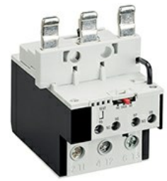
RFNA110 Motor protection relay