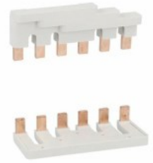
3P Rigid connecting kits for BF40...BF94 BFX3301