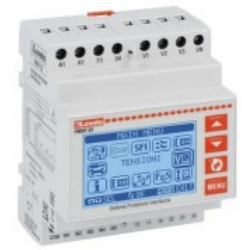
Interface protection system units compliant with Italian standard CEI 0-21 PMVF52