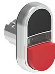
Double-touch actuators, spring return white indicator - One extended and one flush pushbuttons LPSBL72