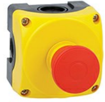
Yellow control station LPZP1A5 complete with mushroom pushbutton pull-to-release LPCB6744 1NO+1NC LPZP1B5610