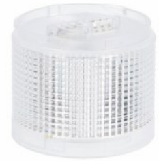
Signal tower Ø70mm/2.75" LTN70