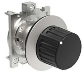
Selector switch actuator knob - 2 position LPFS42