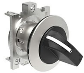
Selector switch actuators lever - 2 position LPFS12