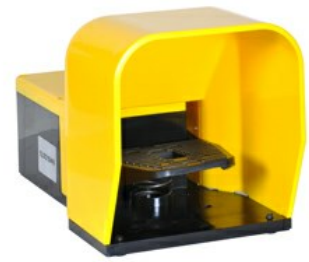
One pedal, with free actuation - with cover KG200