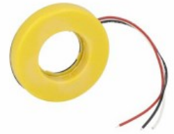
Illuminated disk for mushroom head pushbuttons LPXDAU