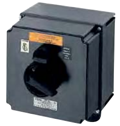
3-pole, 80 A