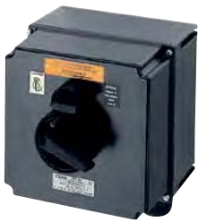
3-pole, 80 A