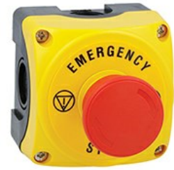
Yellow control station LPZP1A5 complete with mushroom pushbutton turn-to-release LPCB6644 1NC and "emergency/stop" disk LPZP1B5600