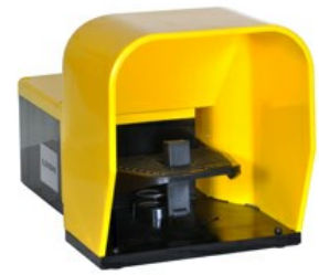
One pedal, with safety lever - with cover KG210