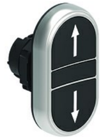
Double-touch actuators, spring return - two flush pushbuttons LPCB71