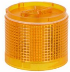
Signal tower Ø70mm/2.75" LTN70