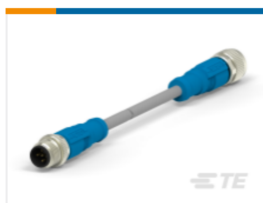
TE Part # 1SET313179R0000 M12-MS-5P-M12-FS-PUR-5.0