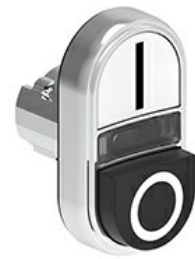
Double-touch actuators, spring return white indicator - One extended and one flush pushbuttons LPSBL72