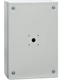
Empty metal enclosures GAZM