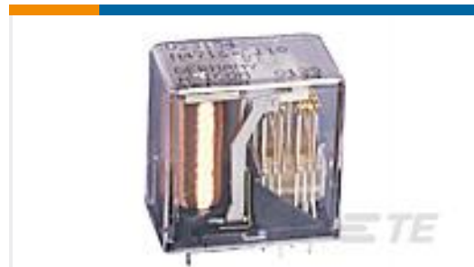
TE Part #8-1393806-6 V23154C 721B104