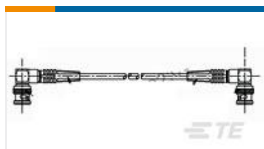
TE Part #1337773-2 50/OHM COAX BNC ELB PLUG ELB P