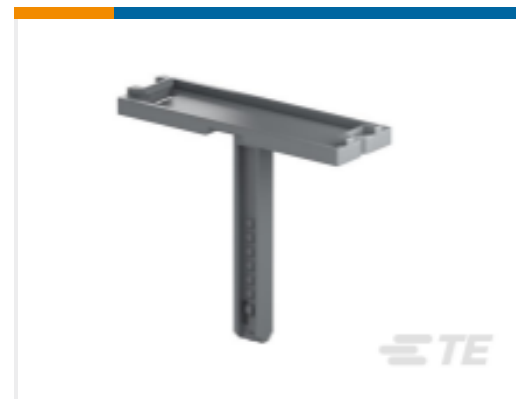
TE Part #1SNK900605R0000 LH