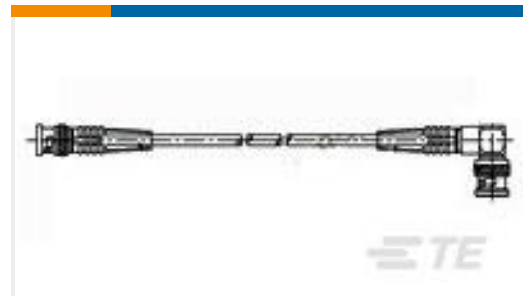
TE Part #1337772-2 50/OHM COAX BNC STR PLUG ELB P