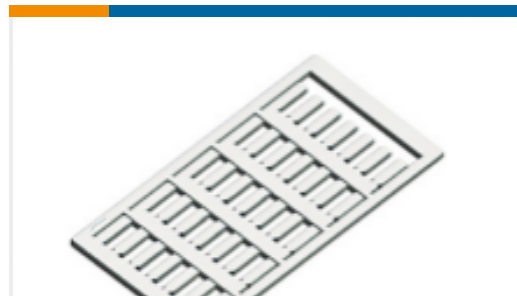
TE Part #1SNA235093R1400 WMTT12