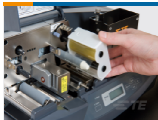
TE Part #1SNA235714R2600 HTP500-CLEAN