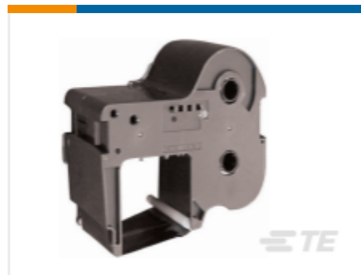
TE Part #1SNA235734R0000 RIB1-B