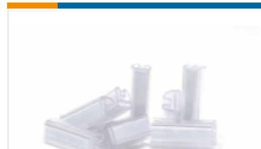
TE Part #1SNA235520R0000 PM124