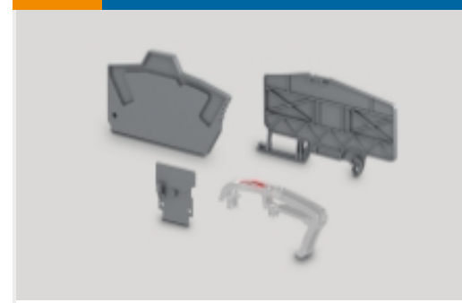
Terminal Block & Strip Insulating Accessories(3)