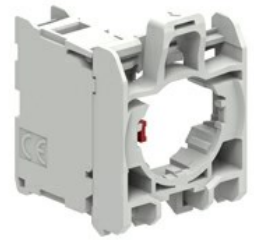
Contact elements - with mountin adapter LPXE