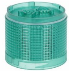
Signal tower Ø70mm/2.75" LTN70