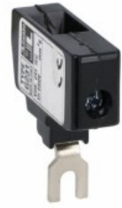
1P enlarged terminals. 1x6mm 2 for BF09...BF25 11G231