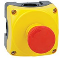
Yellow control station LPZP1A5 complete with mushroom pushbutton turn-to-release LPCB6644 2NC LPZP1B5601