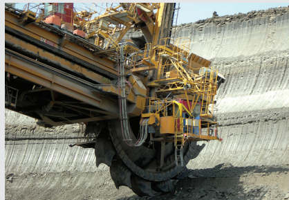
Mining and Minerals