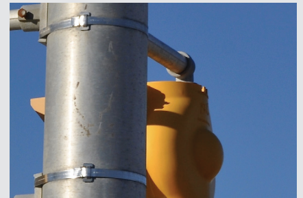
Sign and Signal