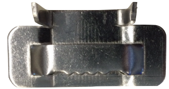
Type E Buckle