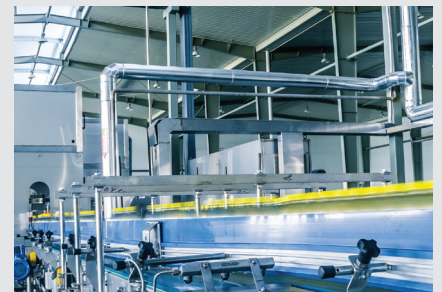
Food and Beverage