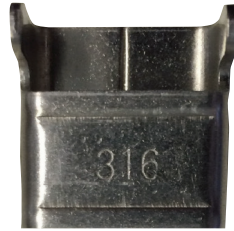
Type L Buckle