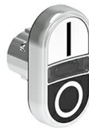
Double-touch actuators, spring return white indicator - Two flush pushbuttons LPSBL71