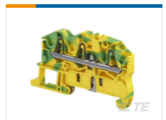
TE Part #1SNK705151R0000 ZK2.5-PE-3P