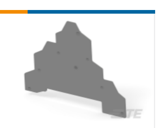
TE Part #1SNK705961R0000 EK2.5-T3