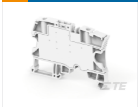
TE Part # 1SNK506313R0000 ZS4-SP-R1