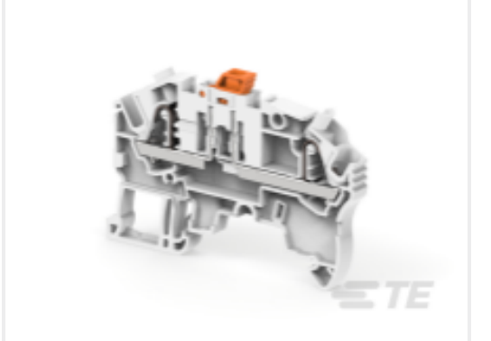
TE Part # 1SNK705310R0000 ZK2.5-S