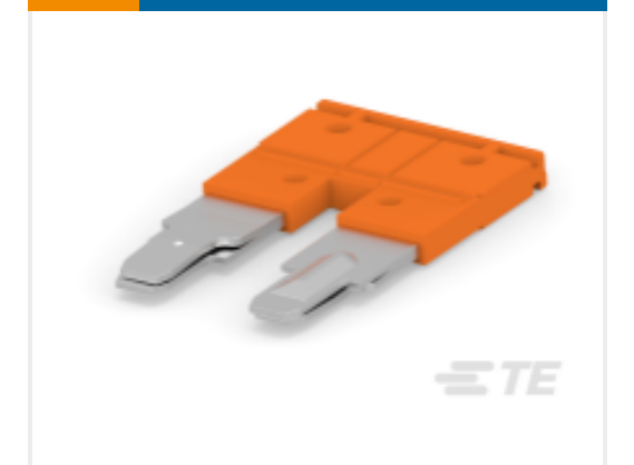
TE Part #1SNK912302R0000 JB12-2