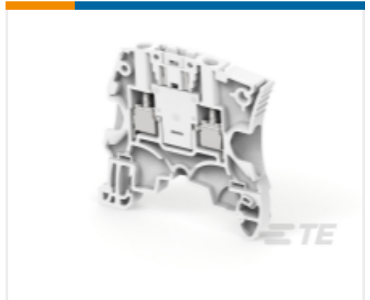
TE Part # 1SNK505313R0000 ZS4-SP