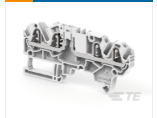
TE Part #1SNK705313R0000 ZK2.5-SP-4P