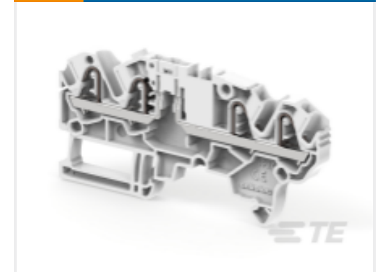
TE Part # 1SNK705313R0000 ZK2.5-SP-4P