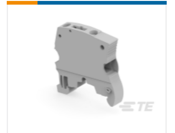
TE Part # 1SNK508316R0000 ZS10-SP