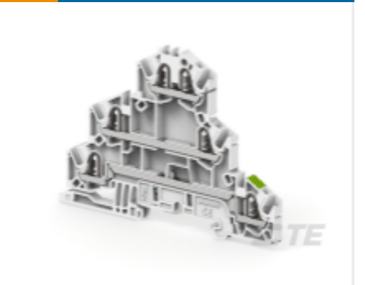
TE Part #1SNK705512R0000 ZK2.5-L-L-PE