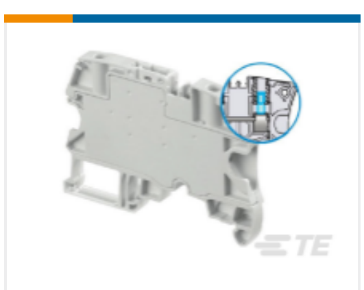
TE Part # 1SNK506314R0000 ZS4-SP-T2-R1