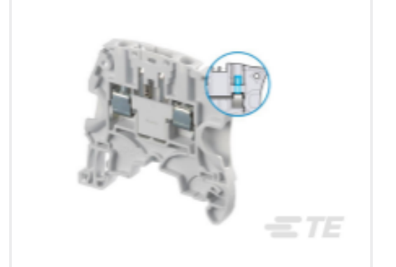
TE Part # 1SNK505314R0000 ZS4-SP-T2