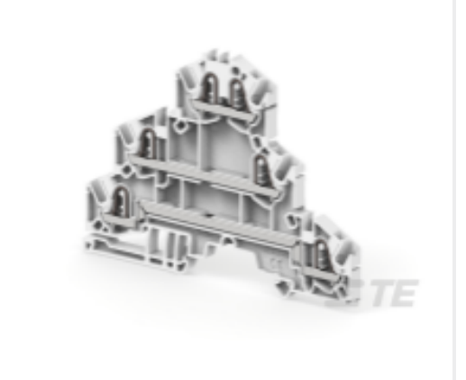
TE Part #1SNK705510R0000 ZK2.5-T3