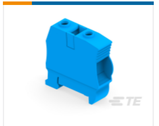
TE Part #1SNK516021R0000 ZS50-BL