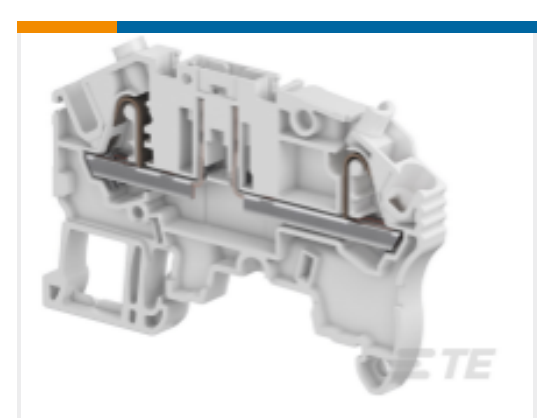
TE Part # 1SNK705311R0000 ZK2.5-SP