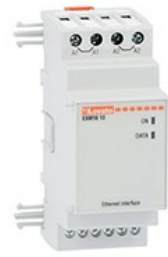
Expansion modules for flush-mount products - communication port EXM1013